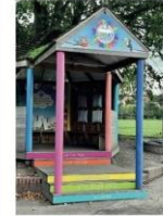
Hollywood Monster for the awesome prints transforming our Library Lodge!